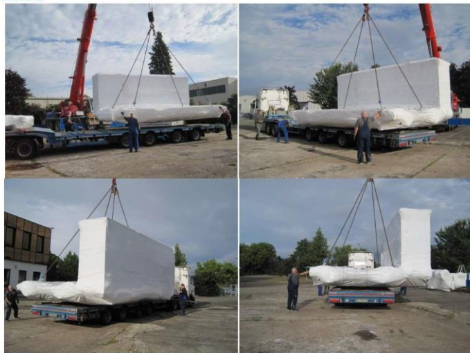
Goods are loaded onto transport equipment at the Loedige factory

The schedule of installation from Oct to Nov 2023 by Loedige specialists.