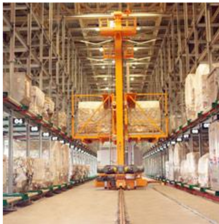
Existing MHS system

On September 28, 2023, one Elevating Transfer Vehicle (ETV) of the Material Handling System (MHS) provided by Loedige Group (Germany) arrived at SCSC Air Cargo Terminal. This is one of the investment items of phase 2 to increase the capacity of SCSC from 200 thousand tons/year to 350 thousand tons/year.