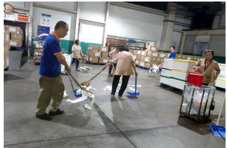
Cleaning and collecting waste