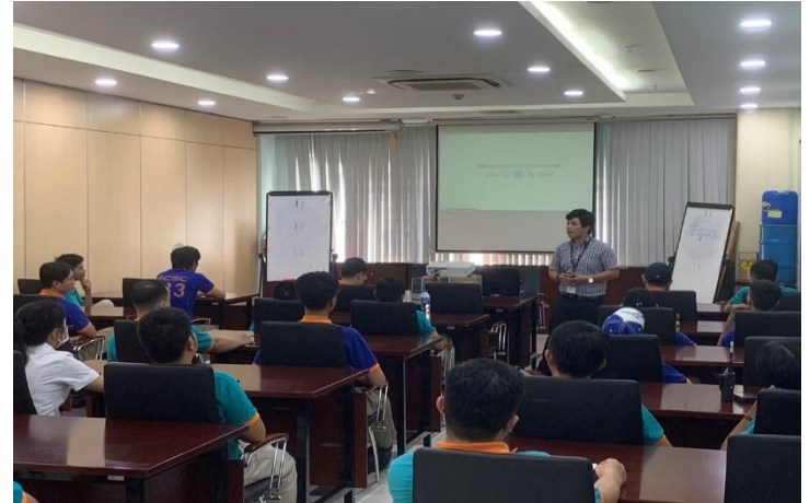
Activities to propagate the environmental awareness

Implementing the campaign to clean up the world at Tan Son Nhat International Airport, SCSC has organized many activities to propagate and mobilize SCSC staff to raise awareness about environmental protection. SCSC always encourage SCSC staff to collect the plastic waste and nylon for recycling to improve our working environment.