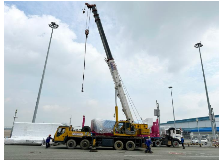
Goods are unloaded at the SCSC Cargo Terminal